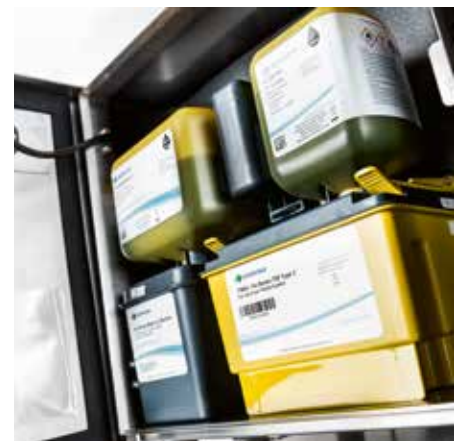
▶ Cartridges for ink and make-up as well as the i-Tech filter module* – all with RFID check

Design, manufacturing and maintenance have all been optimized for maximum availability. The number of parts and seals in the ink system has been significantly reduced with a central hydraulic block. Komax offers service and expertise for the entire system from a single source.