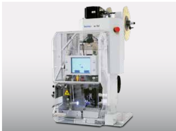
▲ Komax bt 722 standard

This feature reduces the material used and minimizes the setup time.