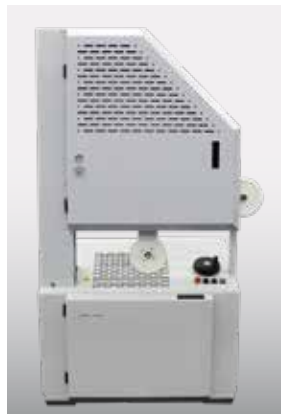
▲ ads 119 active wire delivery system