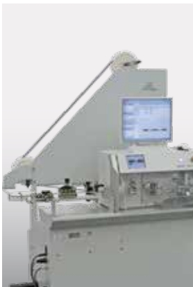
▲ ads 119 With piggyback option