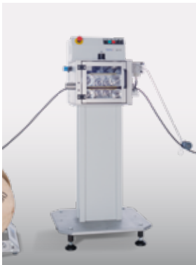
◀ ads 112 Wire pull machine with regulating arm