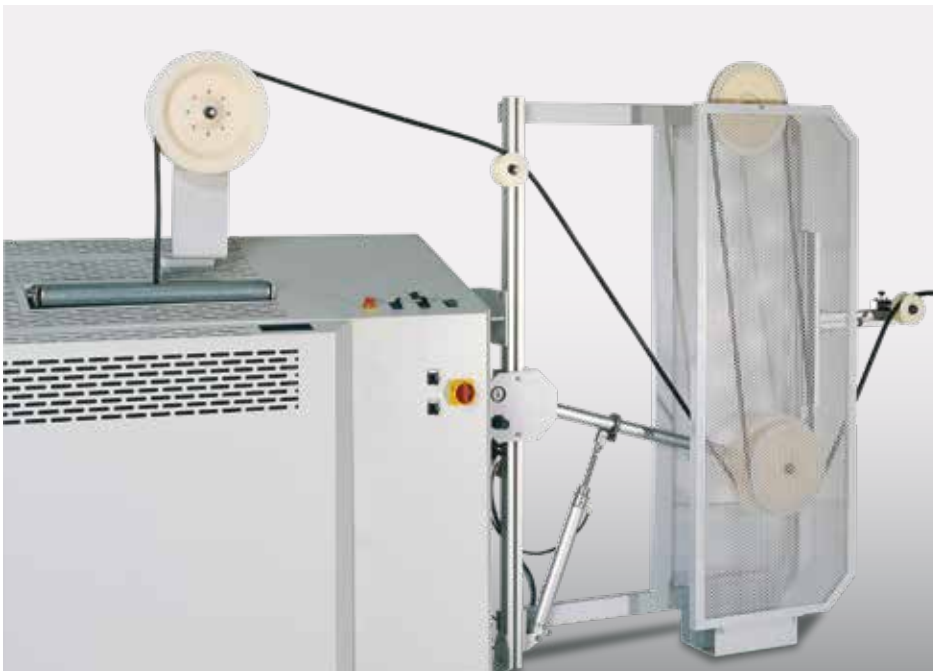
▲ ads 123 With optional Storage-Arm-Down and Down-Plus