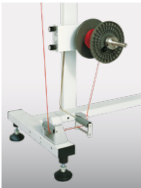
▲ Komax 104 Passive de-reeler

The Komax 104 is designed for use as a passive roller support for small wire reels. The de-reeler is equipped with a finely adjustable rope brake and can accommodate wire reels with an outside diameter of up to 270mm.