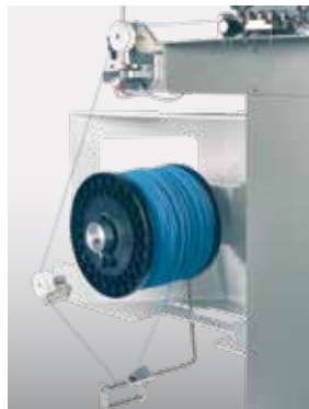
▲ Komax 104 passive de-reeler on Gamma