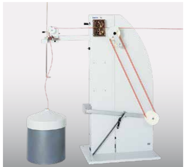
▲ Komax 106 Active feeding system

The Komax 106 is an active feeding system. It can feed from loose coils, wire drums, Conipacks or central wire storage systems. A control algorithm with an automatic learning mode allows the wire processing machine to run at high capacity while the wire bundle is de-reeled at a reduced rate of acceleration and a constant speed. This ensures that feeding is carried out in a gentle, reliable process. Besides wire-end and knot detection, the feed system also has a function for setting a pull-force limit. The Komax 106 is compatible with all automatic processing machines.