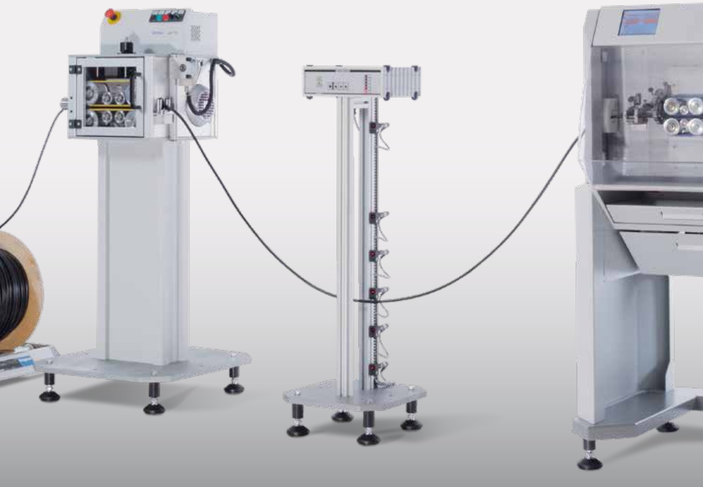
▲ ads 112 Wire pull machine with DHS 1000D wire sage control unit on a Kappa 350