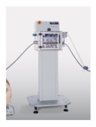
ads 112 Wire pull machine with regulating arm