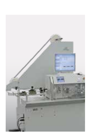
ads 119 With piggyback option