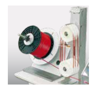
▲ ads 115 active de-reeler with wire reel