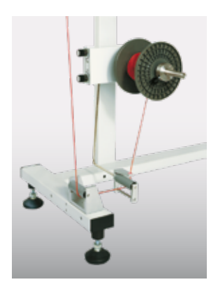
▲ Komax 104 Passive de-reeler

The Komax 104 is designed for use as a passive roller support for small wire reels. The de-reeler is equipped with a finely adjustable rope brake and can accommodate wire reels with an outside diameter of up to 270mm.