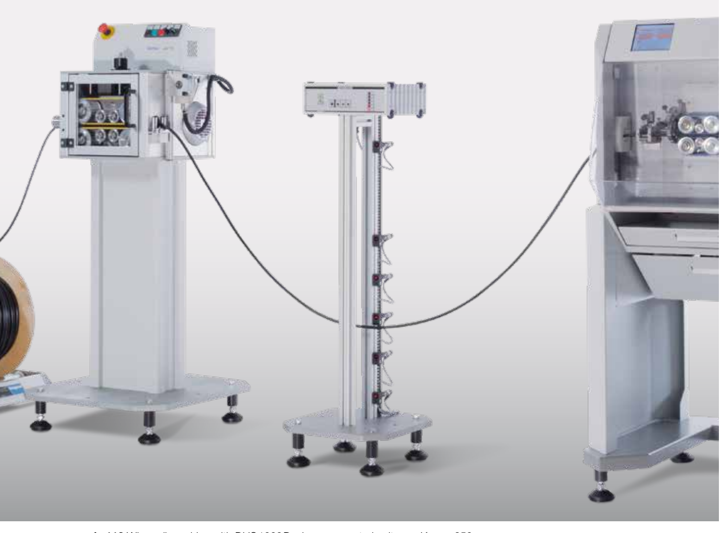
▲ ads 112 Wire pull machine with DHS 1000D wire sage control unit on a Kappa 350