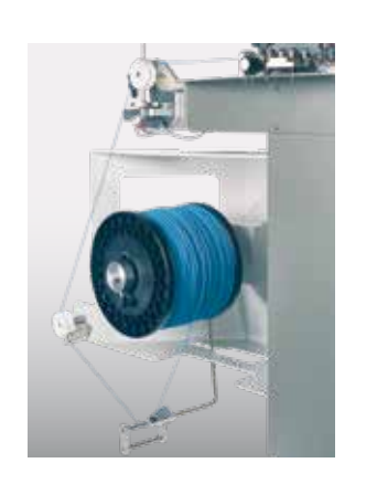
Komax 104 passive de-reeler on Gamma