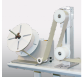
▲ ads 115 With flat cable

The ads 115 wire delivery system is a compact table model ideal for flexible use in tandem with Komax automatic cut-and-strip machines. The de-reeling speed is controlled continuously and adapts to wire requirements. The direction of rotation can be changed if need be. This feature enables cables to be reeled off or rewound. This model accommodates reels up to 400 mm in diameter, loose coils and flat cable rolls.