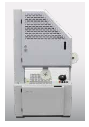
ads 119 active wire delivery system