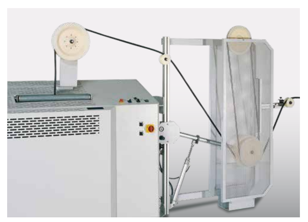
▲ ads 123 With optional Storage-Arm-Down and Down-Plus