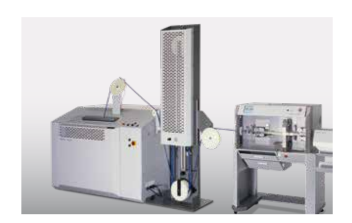
ads 123 ▶ Wire delivery system

Thin, flexible stranded wires and cable as well as conductors up to 35 mm in diameter can run at high rates of speed and acceleration. A roller rotating with the unit immediately detects any problems occurring in the de-reeling of the wire.